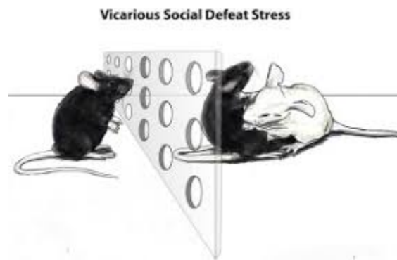
Figure 2. Social defeat stress model (71).

neurobiological changes after social defeat. Sleep deprivation, antidepressants such as clomipramine, imipramine, fluoxetine as well as social interaction can prevent many consequences of social stress [62,63,65,66,67]. Therefore, social defeat stress is generally interpreted as a model of human depression. In addition, this model suggests that treatment with antidepressants can improve social incompatibility just chronically and not acutely [68]. However, this model has two major drawbacks; one is that short-term pattern is more likely to show anxiety phenotype (not depression), and the other is that only male rodents can be used in this model because female rats do not fight each other in resident-intruder confrontation [69,70].